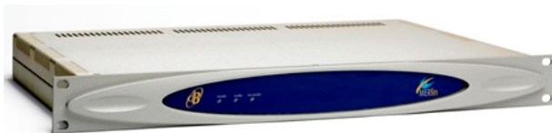
dB Broadcast's MERlin Unit